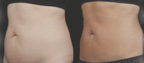
©2014 SculpSure Before & After 8 Weeks 2 Treatments, Flanks and Abdomen Weight Change: +2 lbs. Courtesy of S. Doherty, MD