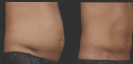
©2014 SculpSure Before & After 12 Weeks, 2 Treatments, Flanks & Abdomen Weight Change: -6 lbs. Courtesy of S. Doherty, MD