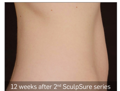
12 weeks after 2 nd SculpSure series

AREAS TREATED: Upper & lower abdomen, left & right love handles