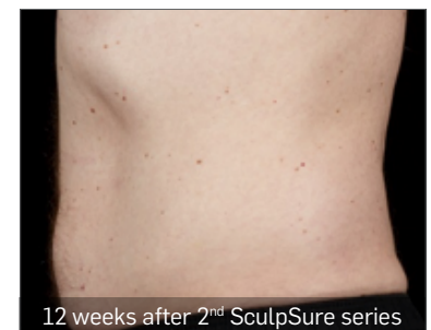
12 weeks after 2 nd SculpSure series

AREAS TREATED: Upper & lower abdomen, left & right love handles